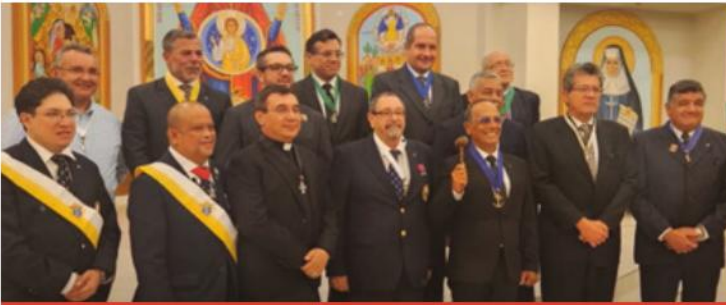
Ministry of the Month